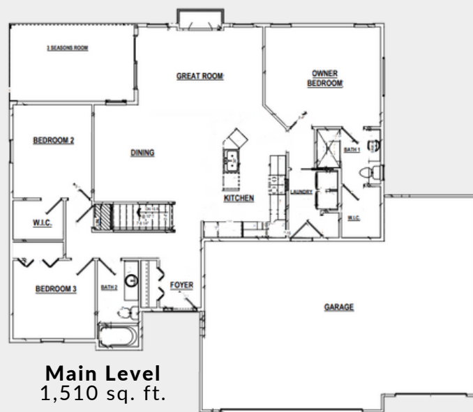
Main Level 1,510 sq. ft.