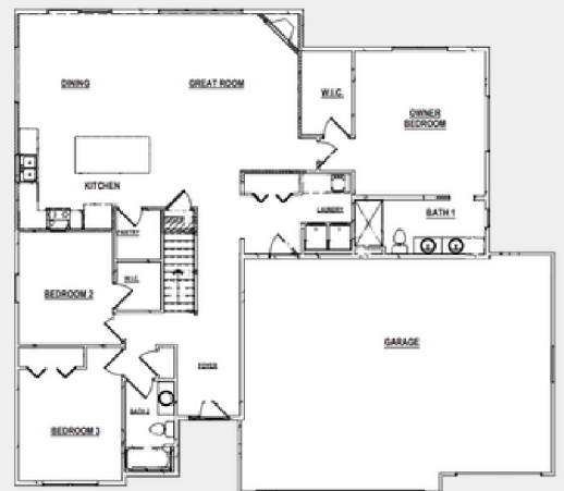
Main Level 1,845 sq. ft.