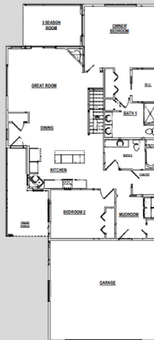
Main Level 1,680 sq. ft.