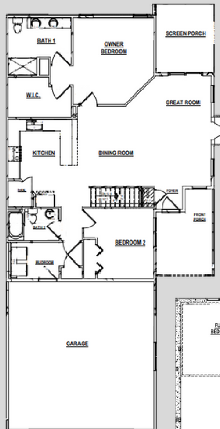
Main Level 1,436 sq. ft.