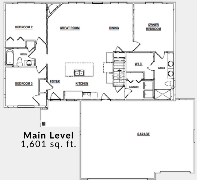
Main Level 1,601 sq. ft.