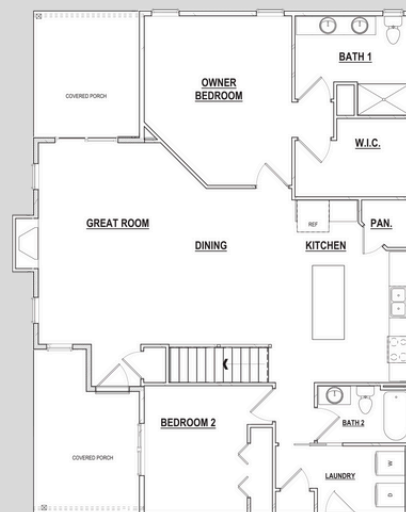
Main Level 1,489 sq. ft.