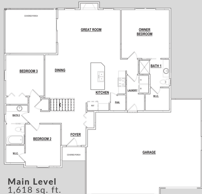
Main Level 1,618 sq. ft.