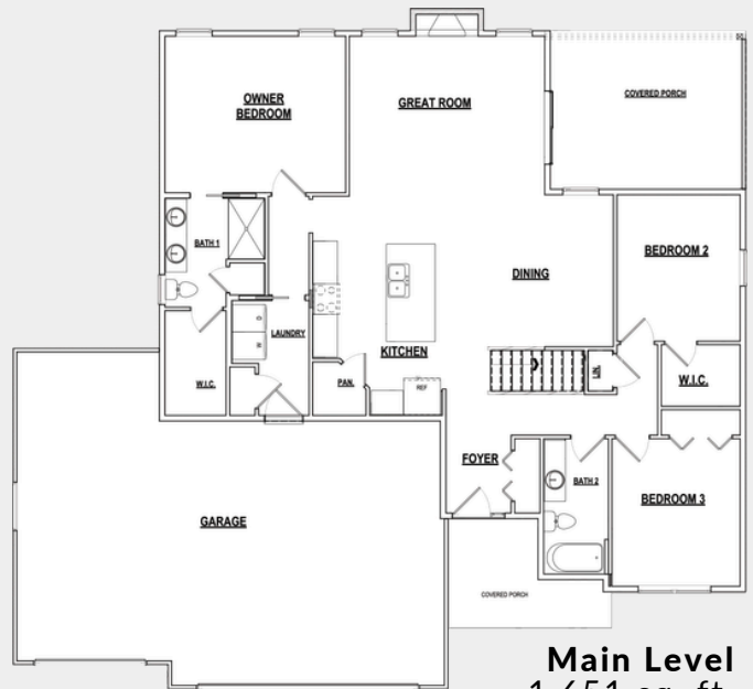
Main Level 1,651 sq. ft.